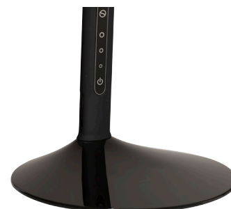
PROLITE™ LINK, black with tablebase